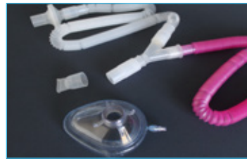
Patient Breathing Circuits (Mask & Mouthpiece options)