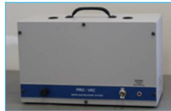
Pro-Vac Portable Scavenger