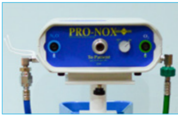
Pro-Nox™ Mixer Head Unit with Gas Regulators & Hoses

Non-opioid relief of procedure pain and anxiety with premium features, including: