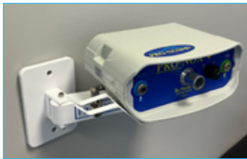
Wall Mount Version