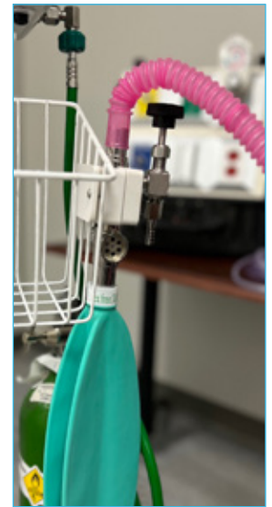
Active Scavenger System